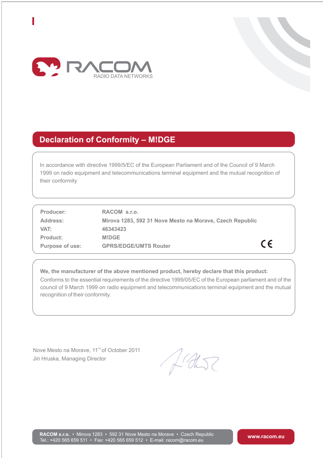
Fig. 2: Declaration of Conformity MIDGE