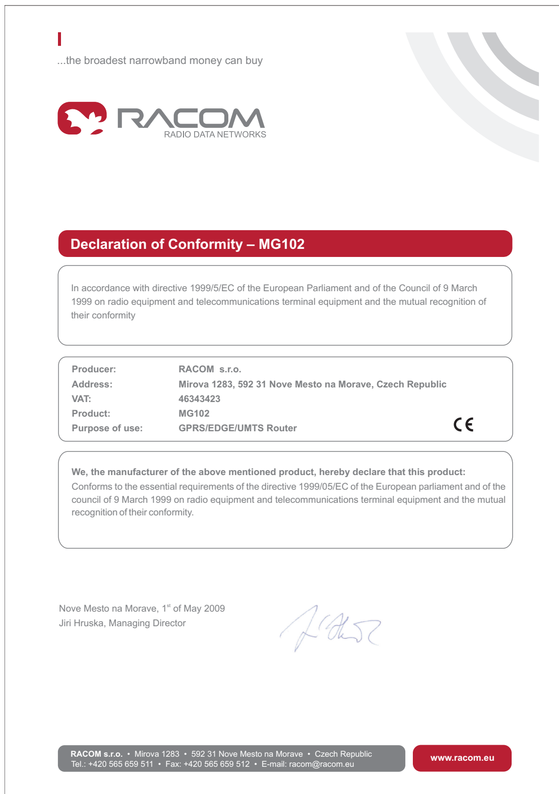
Fig. 1: Declaration of Conformity MG102