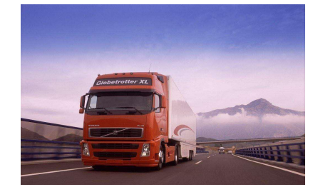
Cold Chain Shipment