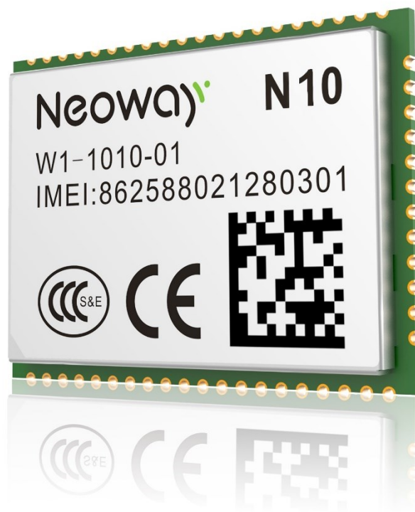
Figure 4-1 N10 OpenCPU appearance